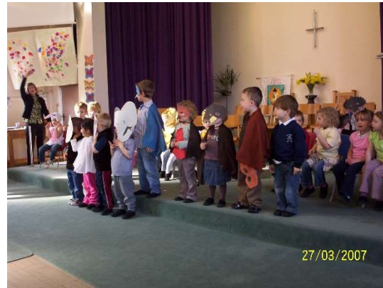
church used for spring production