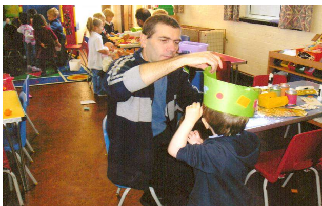
Dad having fun at "Dad's day"