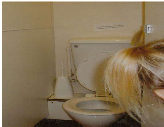
low level toilet