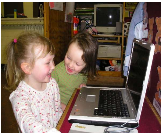
having fun on the computers