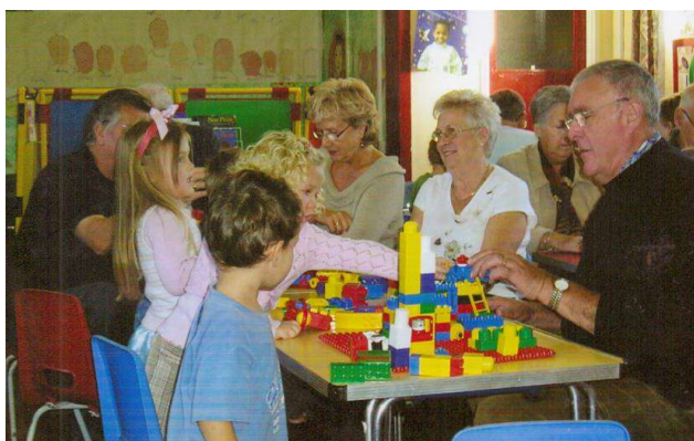
Grandparents enjoying their visit