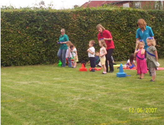
grass area used at sports day

low level toilets & disabled toilet use of church for productions I.C.T. availability