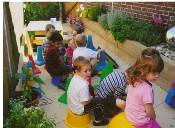
fun in the sensory garden