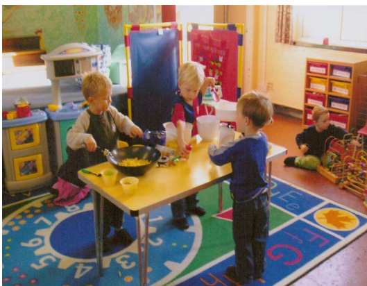
role play in the main hall